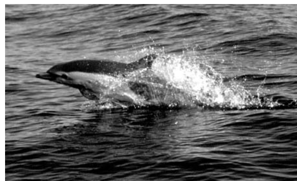
Both harbor seals ( Phoca vitulina , top) and common dolphins ( Delphinus spp., bottom) live in the ocean and surface to breathe air.