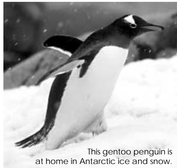
This gentoo penguin is at home in Antarctic ice and snow.

p o l a r s n o w s o u t h p o l e s e a w e a t h e r i c e m o u n t a i n s b i r d s c o l d w h a