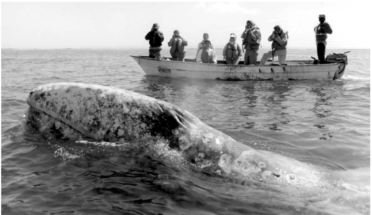
Wildlife enthusiasts observe a gray whale in the warm-water lagoons of Baja California, Mexico.