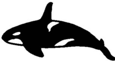
killer whale throughout Pacific Ocean