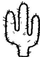
cactus Baja California