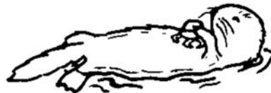
California sea otter central California coast