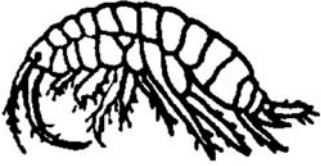
amphipod (food for gray whales) Alaskan feeding grounds