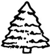
Douglas fir tree northwestern United States