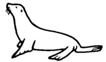
California sea lion California coast to Baja California