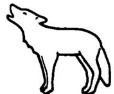
coyote Baja California