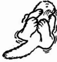
Alaska sea otter Alaska