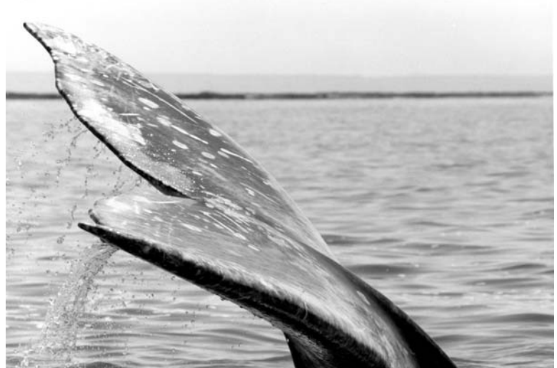
As it begins a deep dive, a gray whale lifts its tail flukes.