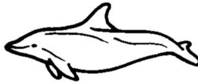
bottlenose dolphin Southern California