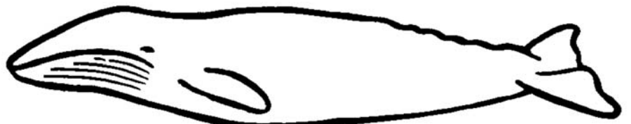
adult gray whale