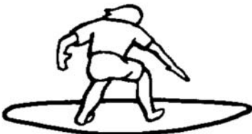
surfer Southern California