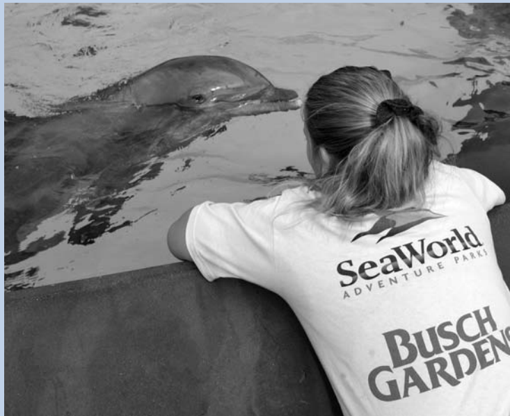
At SeaWorld Adventure Camp, a young ethologist studies a bottlenose dolphin.

time swimming alone = \text{total time} - (\text{breaches} + \text{bows} + \text{lobtails} + \text{contacts}) = 7,200 - (320 + 72 + 171) = 6,637 \text{ seconds} (\text{or } 110.6 \text{ minutes or } 1.8 \text{ hours})