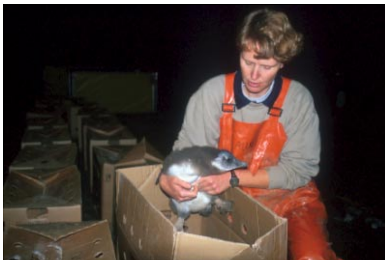
SeaWorld bird experts flew to South Africa to help clean and care for oiled African penguins after a devastating oil spill off Cape Town in 2000.