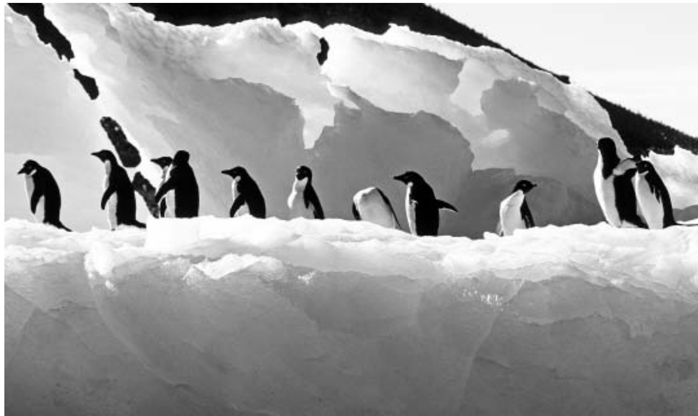
Penguins do not fly. To avoid predation, penguins generally live where there are few land predators.

Sometimes a species is so common, such as starlings, that most people may not know it was ever non-native. And misinformation can be confusing. For instance, two species found in polar regions, penguins and polar bears, are often pictured together in cartoons, movies, greeting cards, souvenirs, and so on. However, penguins and polar bears live on opposite sides of the world. Penguin species are found on every continent in the Southern Hemisphere. In addition, penguins generally live on islands and remote continental regions that are free of land predators, where their inability to fly is not detrimental to their survival. To the north, polar bears are found throughout the circumpolar Arctic.