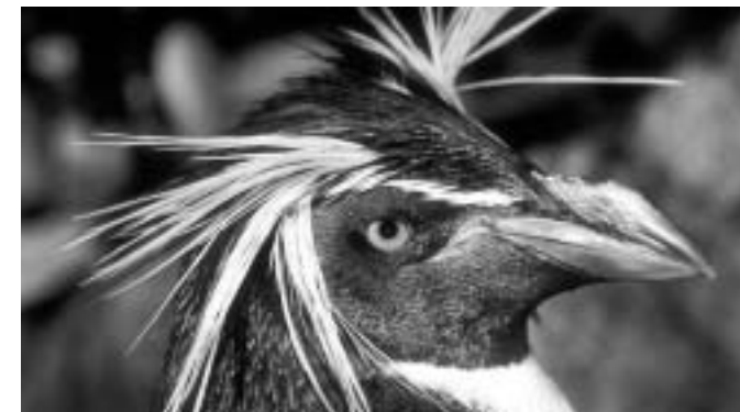
How would the Arctic ecosystem change if penguins were introduced to it?