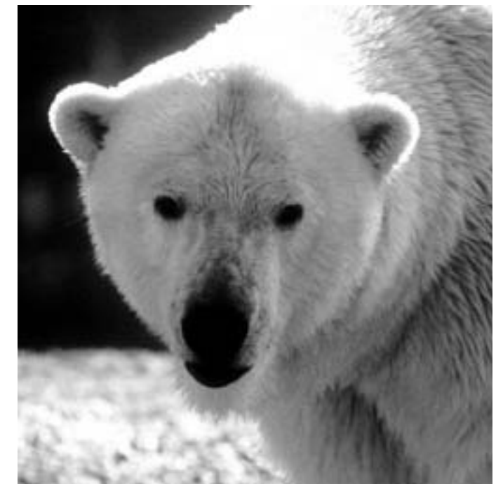
Polar bears ( Ursus maritimus ) are not found in the Antarctic region, but what would happen if they were brought there?